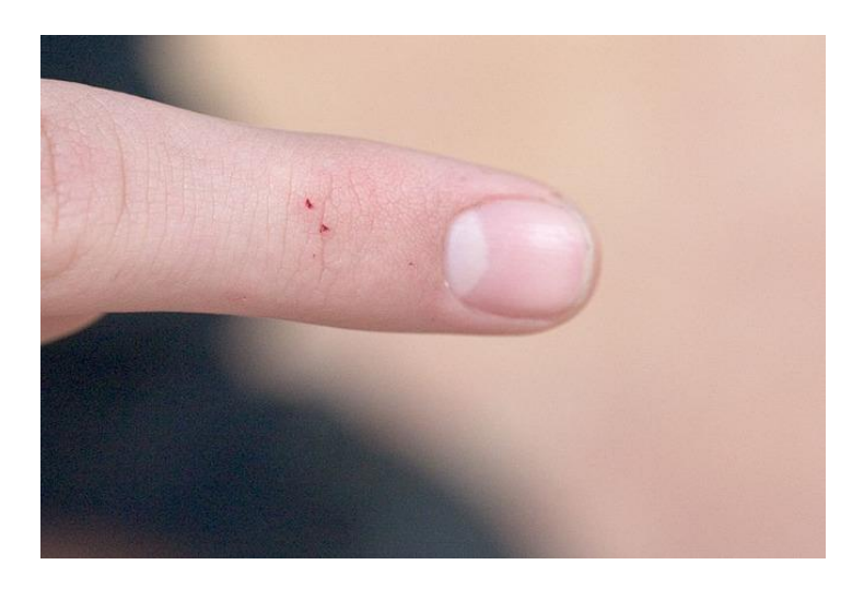
Bite from a Latrodectus spider.

Therefore, not every bite will require a trip to the hospital or treatment with antivenom. In fact, antivenom is normally given only in cases in which the injected venom has caused severe illness.