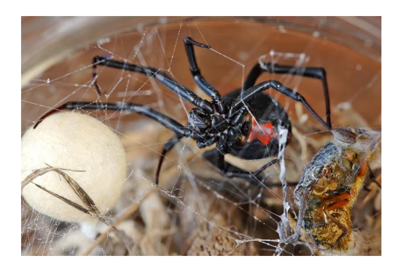
Female redback with egg sac and prey (a blowfly).

If you do get bitten, don't panic. For healthy people, a redback bite is not an immediate emergency. It is advisable to have someone stay with you and observe you for a few hours, in case severe symptoms develop, so that they can get you to a hospital.