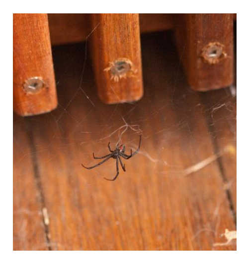
A redback spider in a corner of a household deck.

When gardening, wear gloves and shoes. Be careful when disposing of rubbish or litter piles. Inactive cars are also great places for redbacks to build webs.