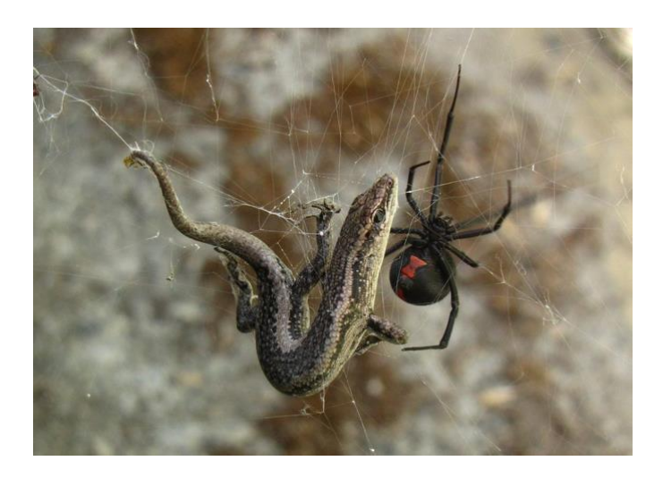
A redback spider with a small lizard captured in its web.

They use their venom to kill their prey following capture. Of the hundreds of compounds in their venom, only a single toxin, alpha-latrotoxin, is responsible for deaths in humans and other vertebrates.