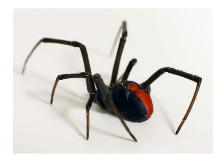
Female redback spider (Latrodectus hasselti).

Adult females are jet black (with a red stripe), whereas juvenile females are generally brown with white markings. Males are normally light brown with white markings, but lack the distinctive red stripe.